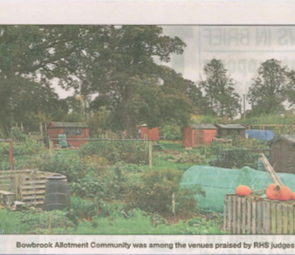
Bowbrook Allotment Community was among the venues praised by RHS judges

The town's new monument is a tribute to the fallen heroes of the town. The monument is located in the town's center, which is a popular spot for children to play.