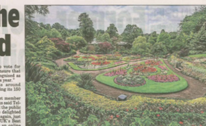
Shrewsbury's Quarry and its magnificent Digby is in the running for a national award

The town's new monument is a tribute to the fallen heroes of the town. The monument is located in the town's center, which is a popular spot for children to play.